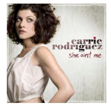
She Ain't Me 2008