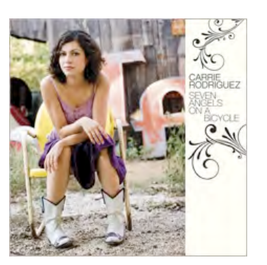
7 Angels On A Bicycle 2006