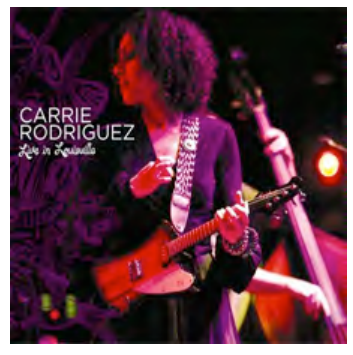
Live in Louisville 2009