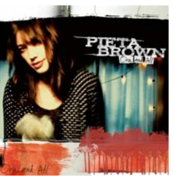
ONE AND ALL 2010