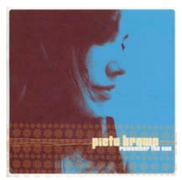
REMEMBER THE SUN 2007