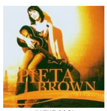
IN THE COOL 2005