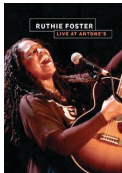
2011 Live At Antone's (CD/DVD)