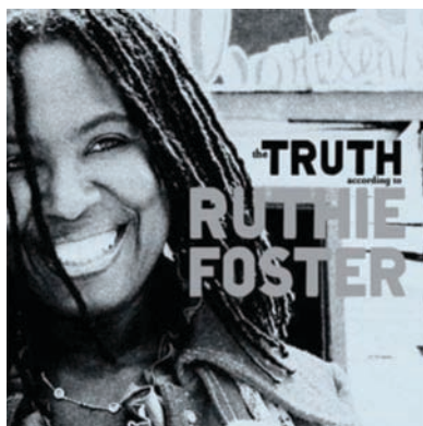
2009 The Truth According To Ruthie Foster GRAMMY NOMINATED