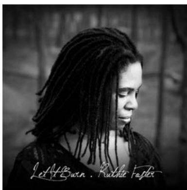
2012 Let It Burn GRAMMY NOMINATED