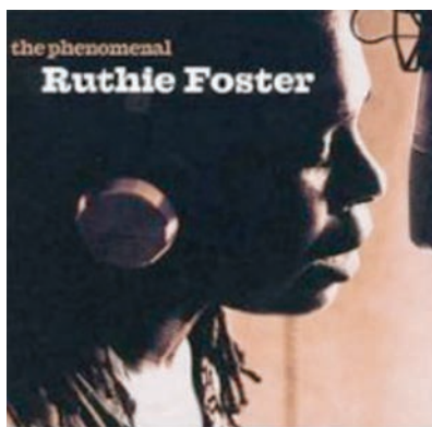
2007 The Phenomenal Ruthie Foster